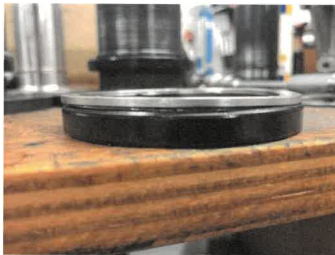
Fig. 2 oil seal and retaining ring

When the first gearbox was stripped down and the oil seal removed, it was found that the inner metal retaining ring did not fit properly into the rubber oil seal (Fig. 2). The metal retaining ring is like a 'top hat' and should fit inside an internal groove in the oil seal. This is the probable cause of the oil leak noticed, although it does not appear to affect all gearboxes.