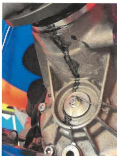
Fig. 1 External oil leak

It should be noted that a small amount of backlash (rotational movement) is normal for all gearboxes and should not be confused with the lateral movement described above.